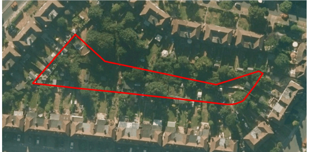
Red line for indicative purposes only

The images displayed are for identification purposes only and interested parties should refer to the legal pack for further clarification.