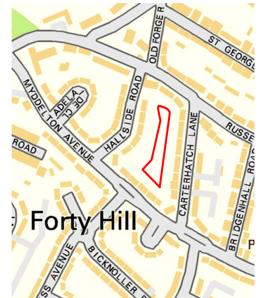
Red line for indicative purposes only

These Particulars were downloaded from BidX1.com. Buyers are strongly advised and assumed to have returned to BidX1.com to read the full terms and conditions associated with this lot, and check the Special Conditions and any applicable Addendum, prior to bidding. Additional costs, charges and encumbrances may apply for Buyers once they have made a successful bid in relation to a property. Where a guide price (or range of prices) is given, that guide is the minimum price at which, or range of prices within which, the seller may be prepared to sell on the date on which the guide price, or range of prices, is published. Please see full disclaimer on BidX1.com for limitations regarding the liability of BidX1.